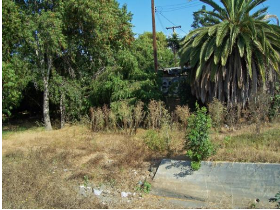
Before Photos 8/30/12

Reach 26 Project 74 400' d/s Artesia Blvd. to 550' u/s Artesia Blvd.