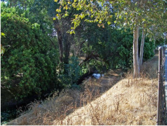
Before Photos 8/30/12

400' d/s Artesia Blvd. to 550' u/s Artesia Blvd.